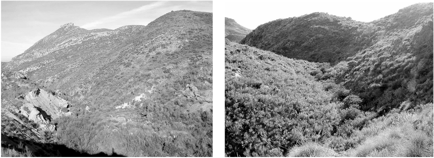
Fig. 2 Habitat where P. germana has been found.

These two Spanish males of P. germana were collected by the first two listed authors, the night of 14.X.2004, at the locality of Sierra Cabrera, near the village of Turre (Almeria) (30SWG90, 480 m). The habitat is a xerothermophilus steppe, with a vegetation very similar to that present in many areas of Morocco, Algeria and Tunisia (fig. 2).